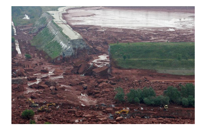
Figure 2.3: The Crack Dam Corner causing the Alumina Spillage at Ajka, Hungary in 2010 (Turi et al., 2013)

Effluents from the mining or milling operations such as additives to the process, oils, organic and flotation chemical (leaching agents, solvent extractants, reagent, surfactants, oxidants) may also cause an environmental threat within tailings (Ritcey, 2005). Cyanidation technology which is used to extract gold efficiently from the ore will cause variable quantities of cyanides, metal-cyano complexes, sulphide and arsenic discarded together in the liquid effluents which could potentially be leaked out into the environment (Kuyucak & Akcil, 2013; Natarajan & Ting, 2015). Highly toxic sodium cyanide (NaCN) is used as primary reagent by the international mining community to concentrate gold and other precious metals since 1887 until today (Korte et al., 2000; Technology, 2016). Around 90% of gold extracted worldwide use cyanide leaching techniques as it is able to dissolve small flecks of gold and other precious metal even from low-grade ore (Mudder & Botz, 2004).